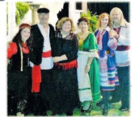
Gulf Coast Hellenic Dancers & Ukrainian Dancers

Free Pictures & Hot Chocolate with Santa Eastern European & Greek Food & Pastries Marketplace Gifts, Fun Family Activities Live Music & Dancing, Church Tours Saturday, December 8, 2018 10:00 am – 5:00 pm – Free Admission!!! Holy Trinity Greek Orthodox Church 255 Beauvoir Road, Biloxi MS 39531 228-860-3376 holytrinitybiloxi.org