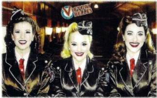
The Victory Belles From The National WWII Museum