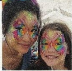
Copypat Face Painting By Catherine Ha