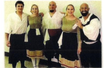
Kefi Dancers from Birmingham AL