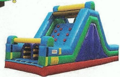
Jumpin Joe's Inflatables 30 ft Obstacle Course w/17' rock wall & dual lane slide