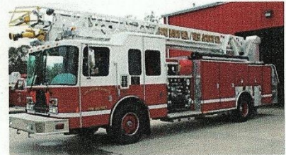
Fire Engine Truck & Fireman Hats