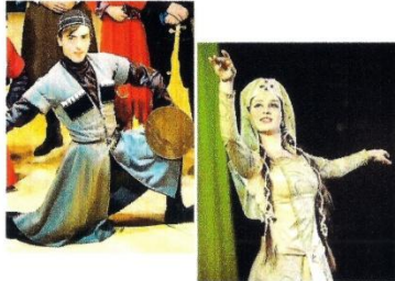
Georgian Dance Ensemble from New York